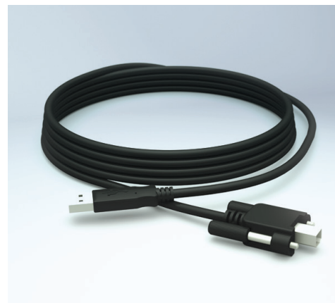
Secure USB Cable